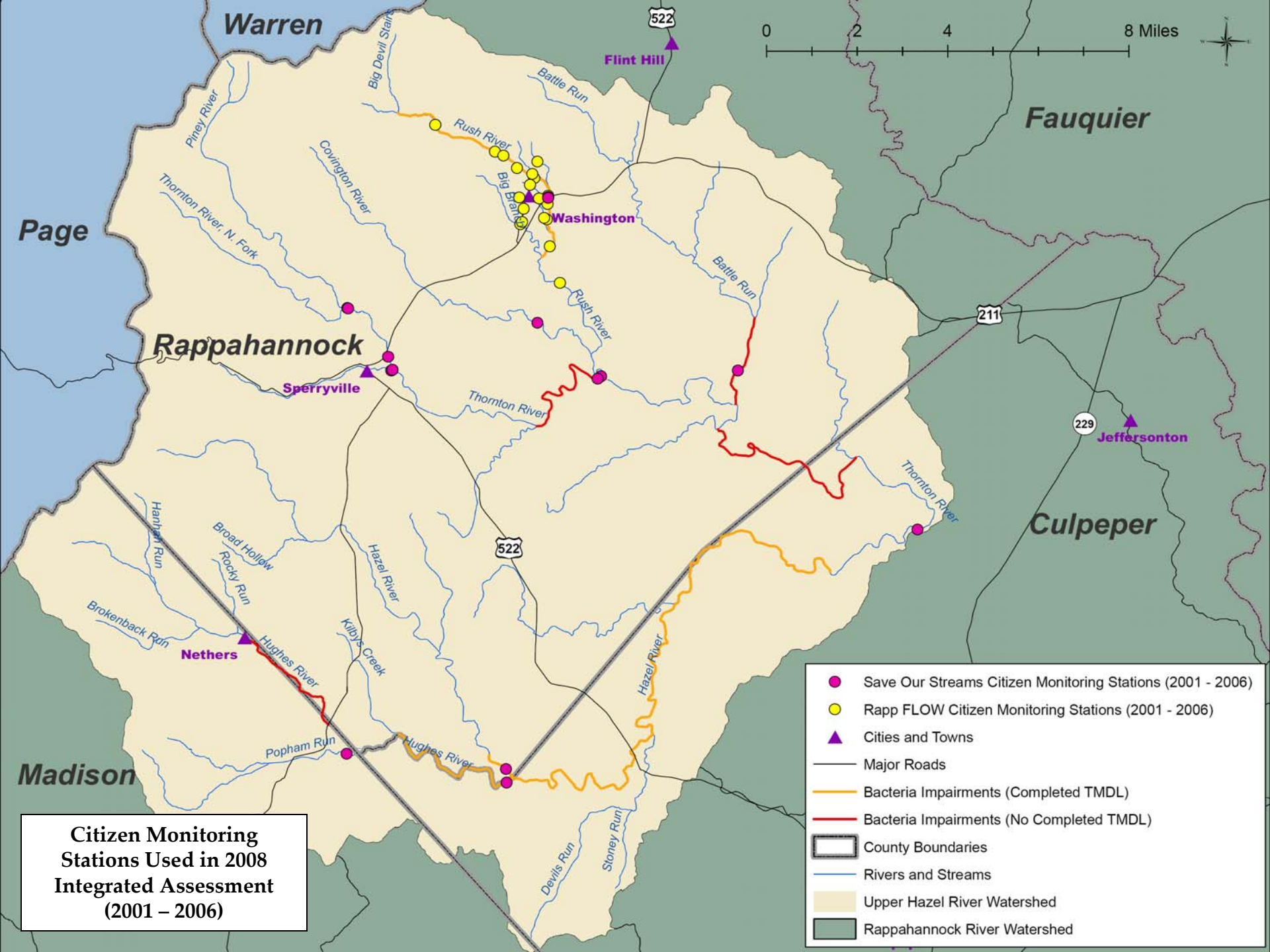
Citizen Monitoring Stations Used in 2008 Integrated Assessment (2001 - 2006)